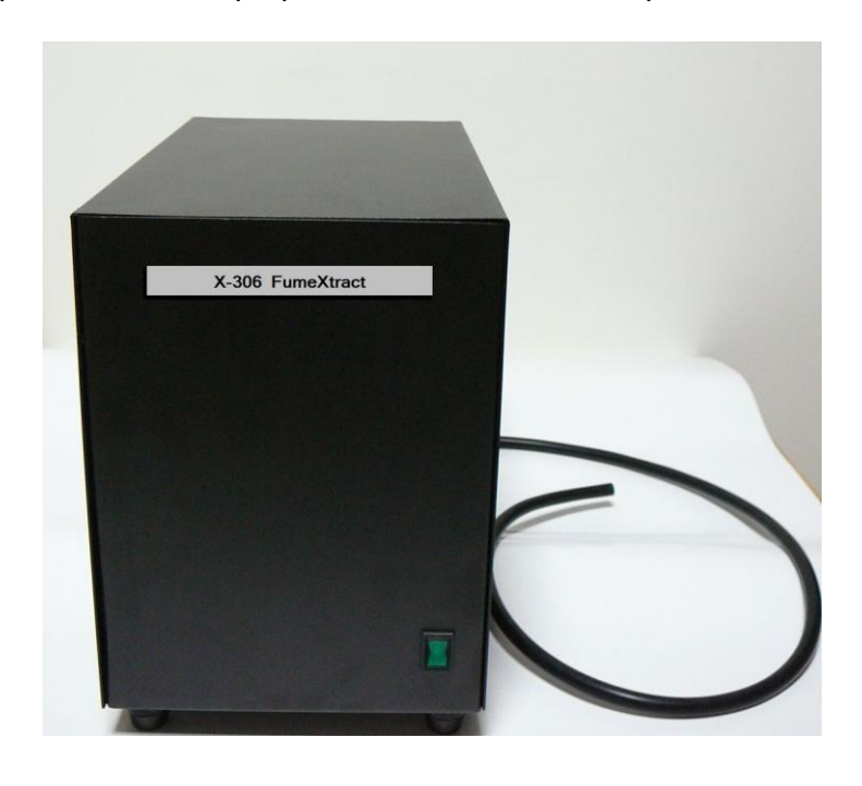
FIG 1. VIEW OF THE SYSTEM

The unit can be supplied from 208-240V and when used to extract fumes from a batch oven can be connected to the outlet provided for this purpose located on the back panel of X-Reflow306 oven.