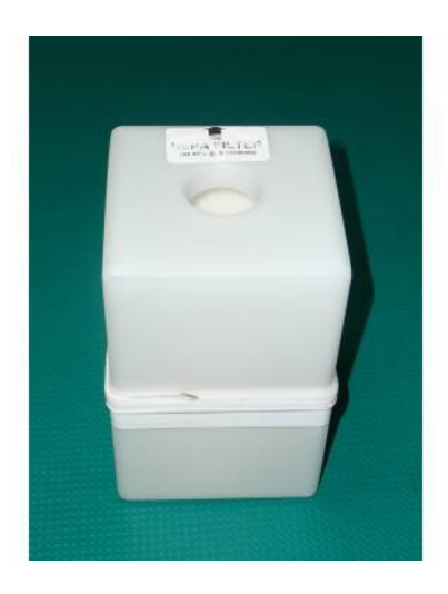
FIG 2. VIEW OF THE HEPA FILTER

As a rule of thumb, if the oven is used daily, changing the filter at least once every 6 months is not a bad idea.